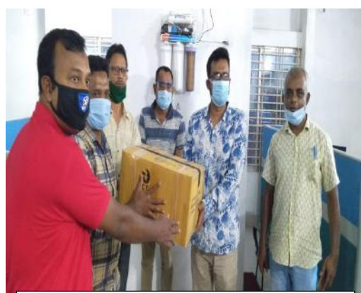
Hygiene Kits Box Distribution

The organization provided 33 infrared electronic thermometers to its all branch offices use for checking body temperature of the employee/staff before entering the office.